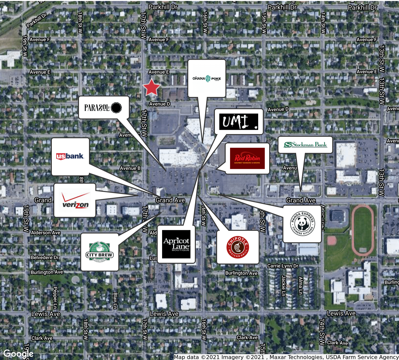
Map data ©2021 Imagery ©2021, Maxar Technologies, USDA Farm Service Agency

1645 Avenue D Suite A Billings, MT 59102