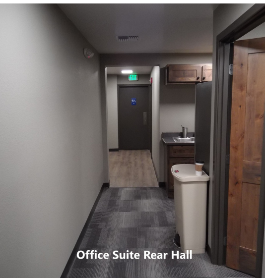
Office Suite Rear Hall