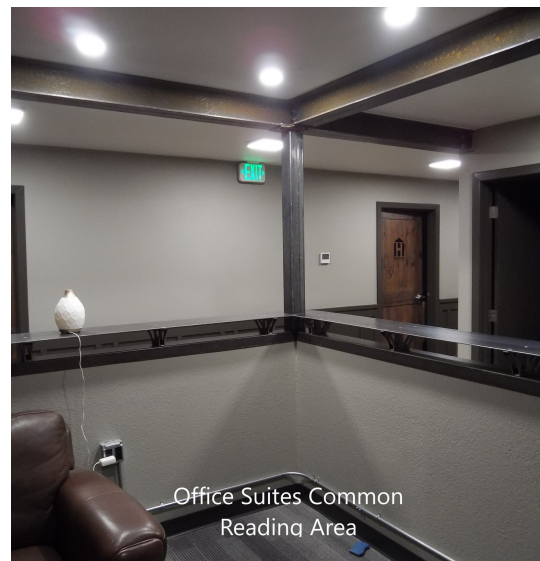
Office Suites Common Reading Area