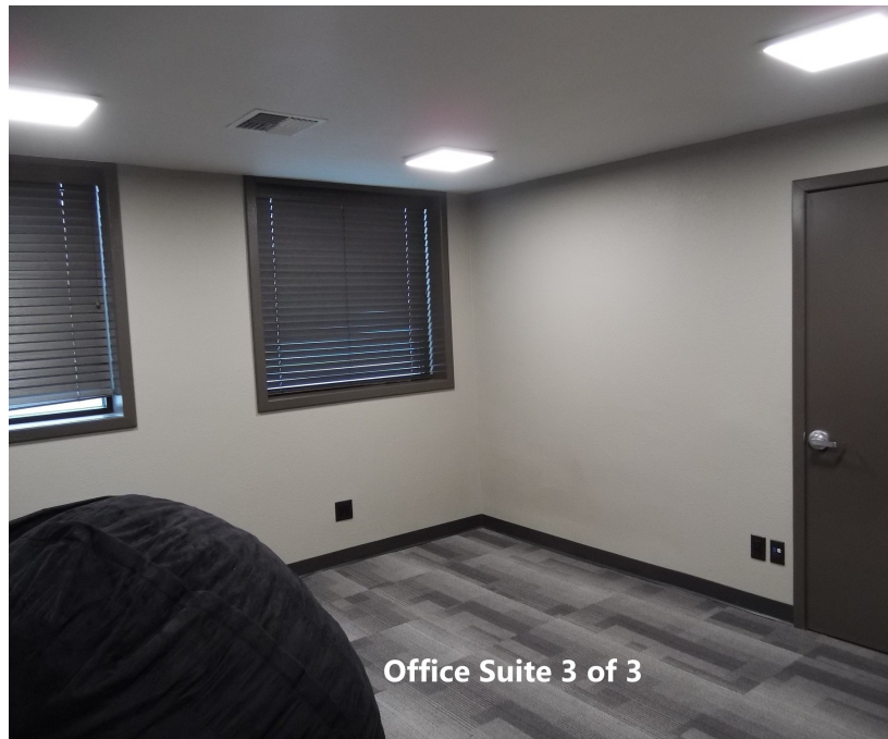
Office Suite 3 of 3