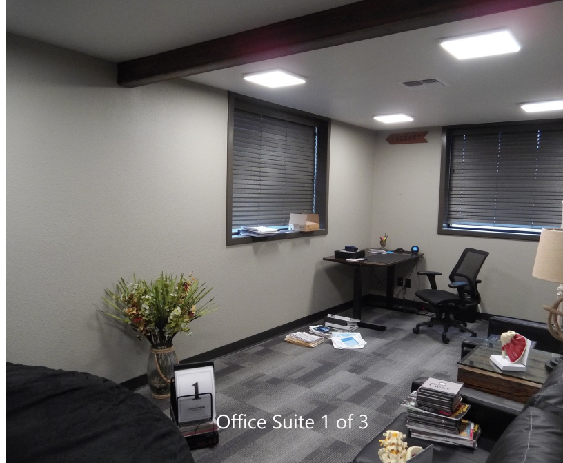
Office Suite 1 of 3