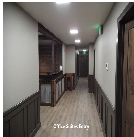
Office Suites Entry