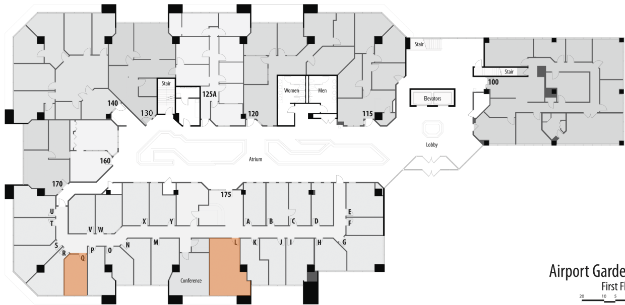
Airport Gardens First Floor