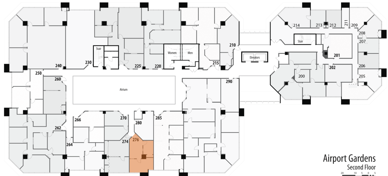
Airport Gardens Second Floor