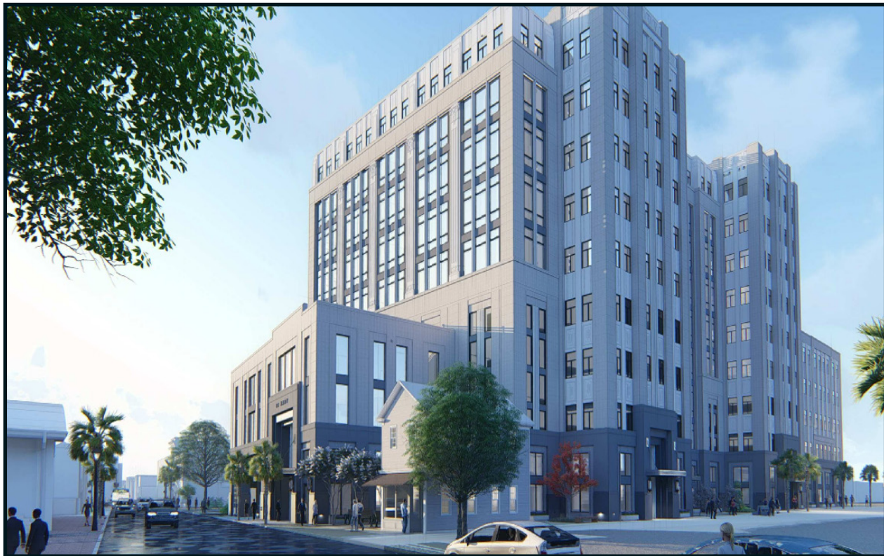
*Future Lowline on the right of both images