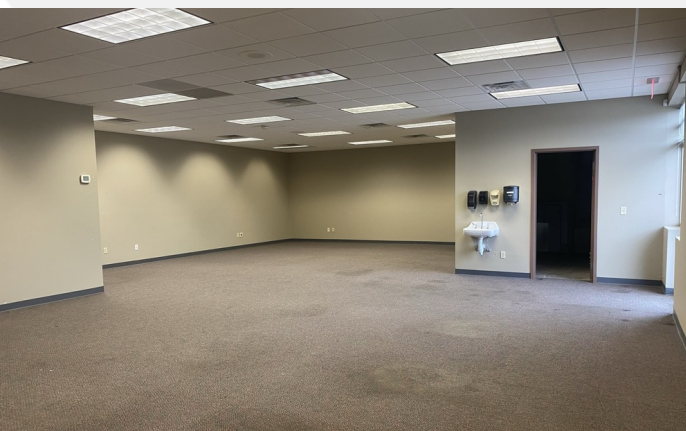
Large Open Office Space