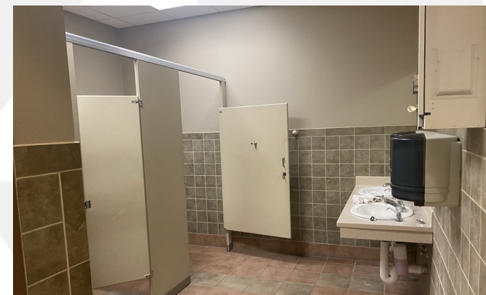
One of 2 Restrooms