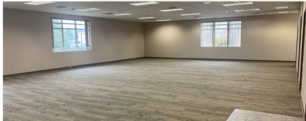
Large Office Area