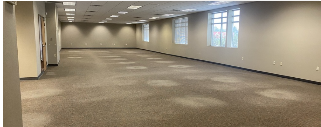
Large Open Office Space