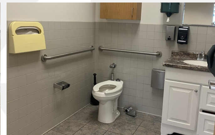
One of 2 Restrooms