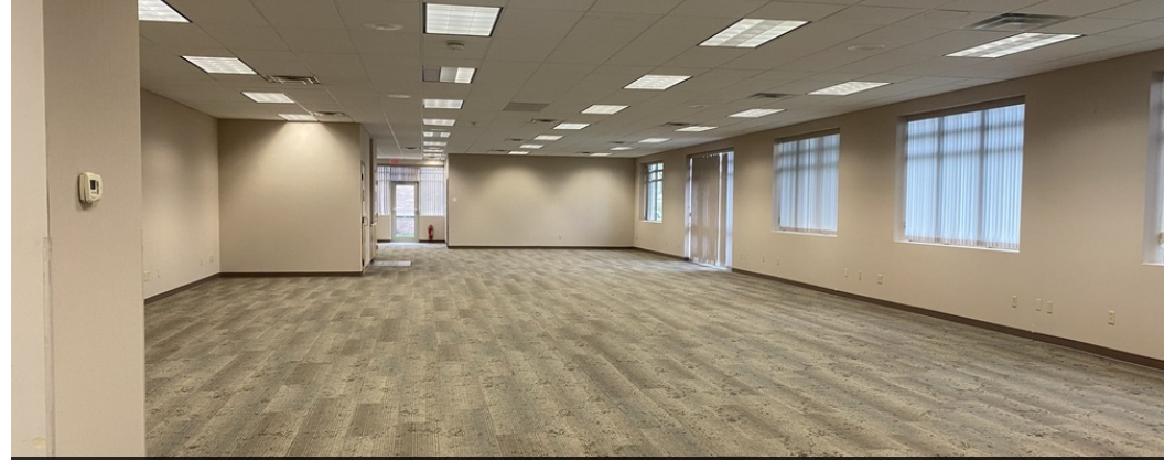
Large Office Area