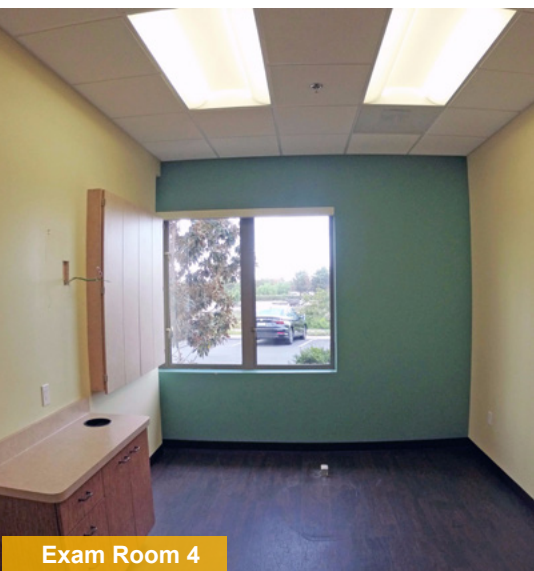
Exam Room 4