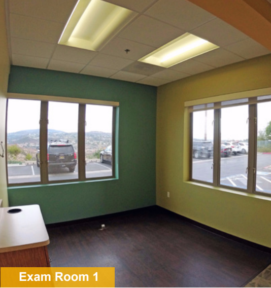
Exam Room 1