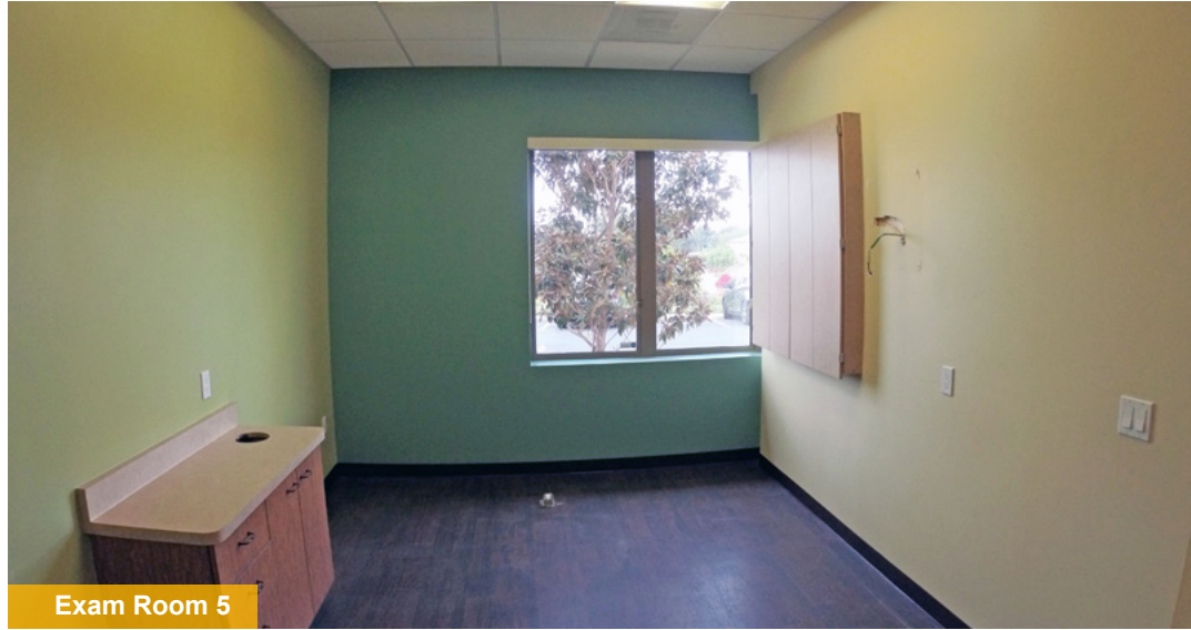
Exam Room 5