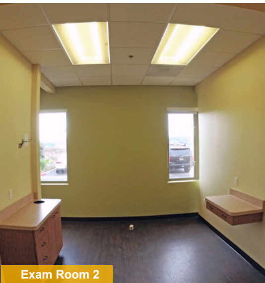
Exam Room 2