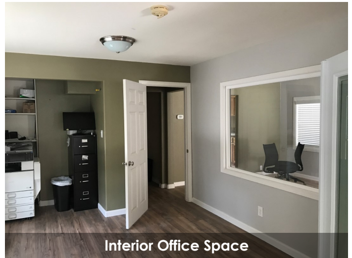
Interior Office Space