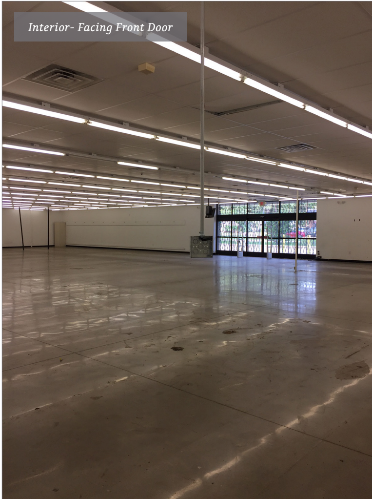
Interior- Facing Front Door