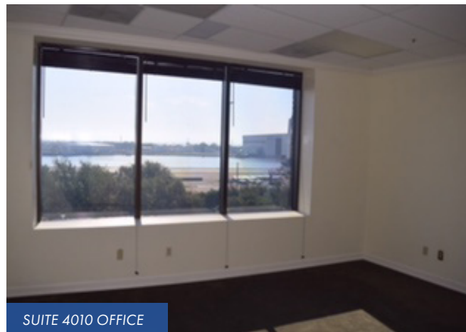
SUITE 4010 OFFICE