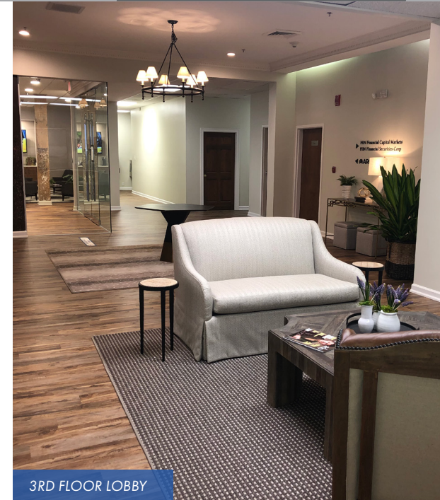
3RD FLOOR LOBBY