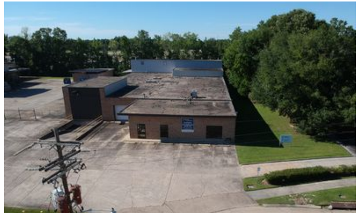
Dual Drone 1