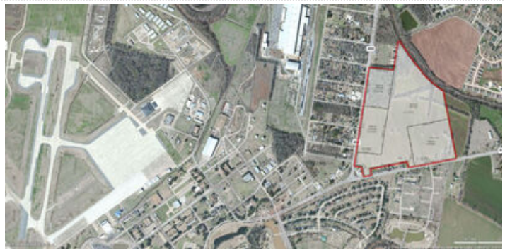
Micro Aerial Overlay