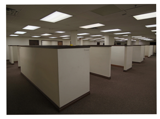
NORTH OFFICE SPACE