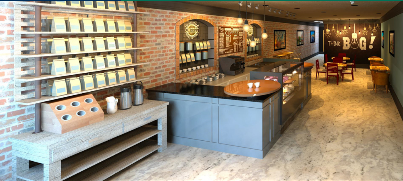
Imagine the endless opportunities for Office | Restaurant/Bar Concept | Showroom

226-228 SW 25th Street, Oklahoma City, OK 73109