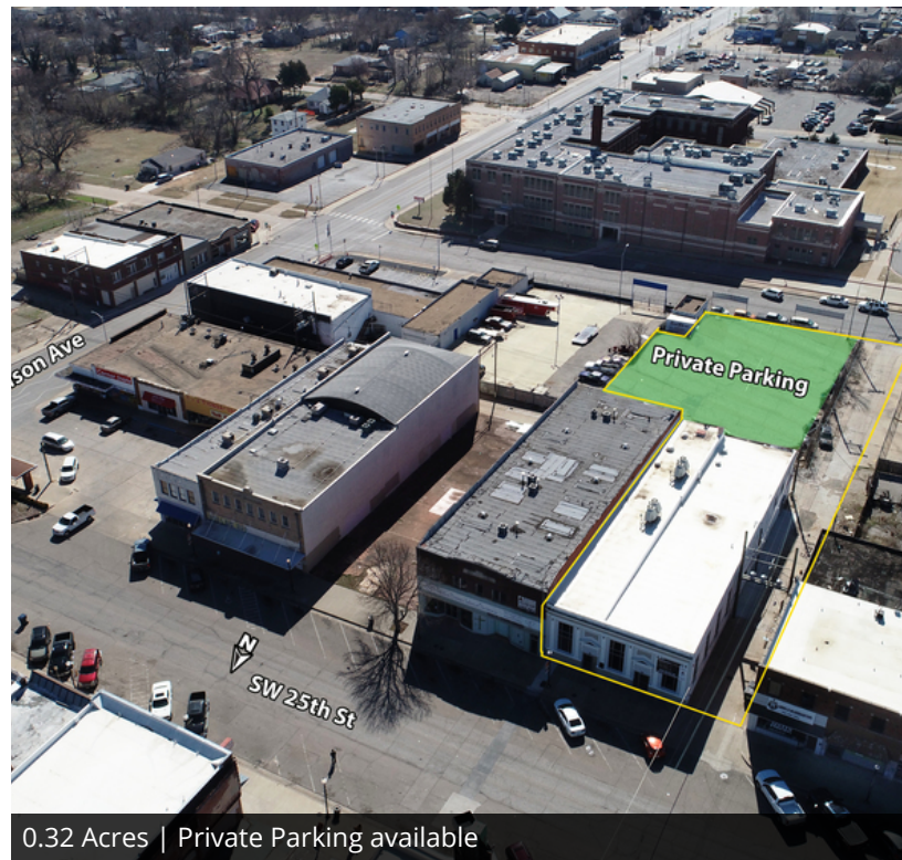
0.32 Acres | Private Parking available

ROSHA WOOD 405.239.1219 rwood@priceedwards.com priceedwards.com