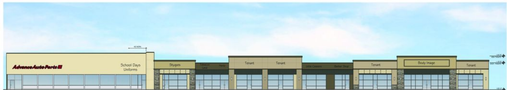
Conceptual East Elevation ARCH. 2/22/15 1:00

71 North Stygler Road, Gahanna, OH 43230