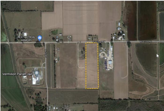
General Location Aerial