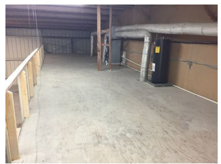
Decked Above Office Area