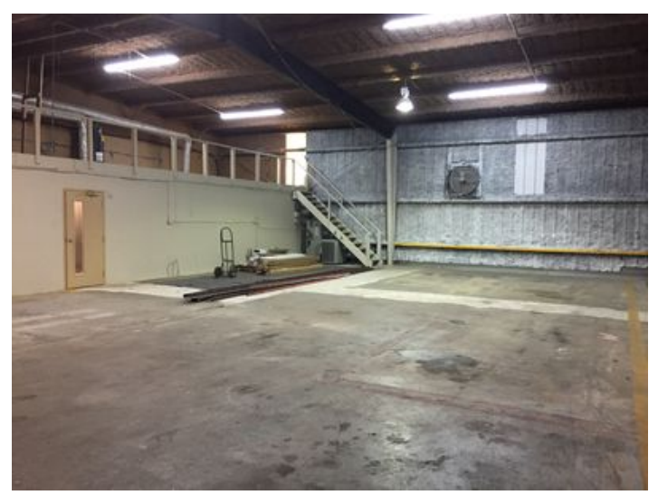
WH Facing Rear