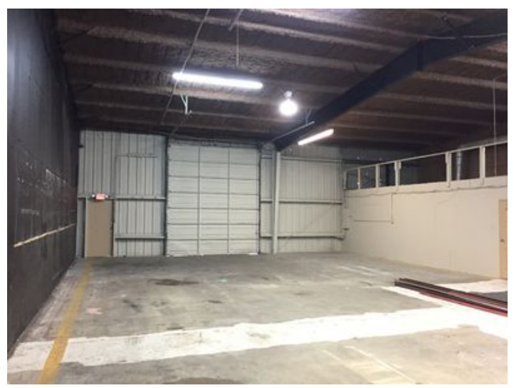
WH Facing Front