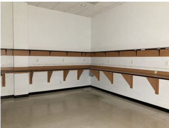
Work Area & Supplies