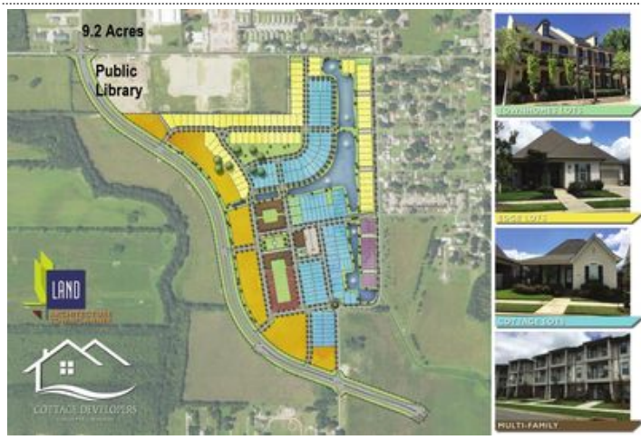
Scott River Ranch-style development-Inserts