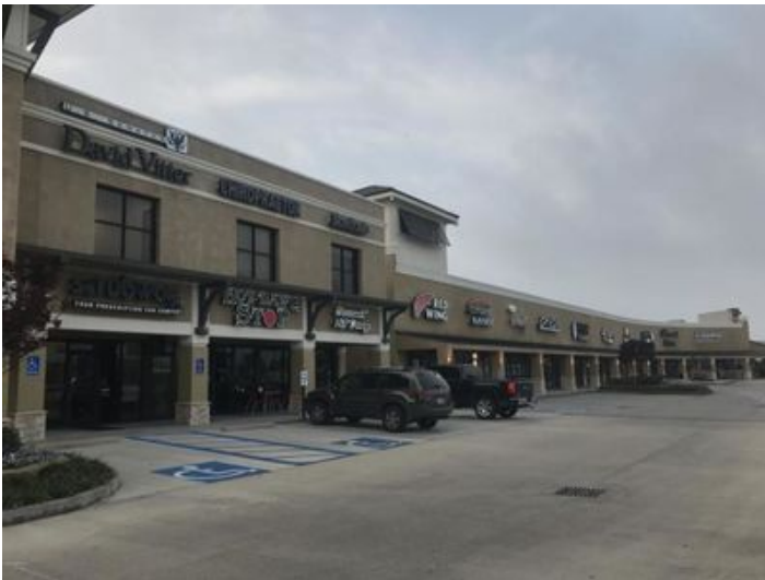
Shops at Martial pic 2