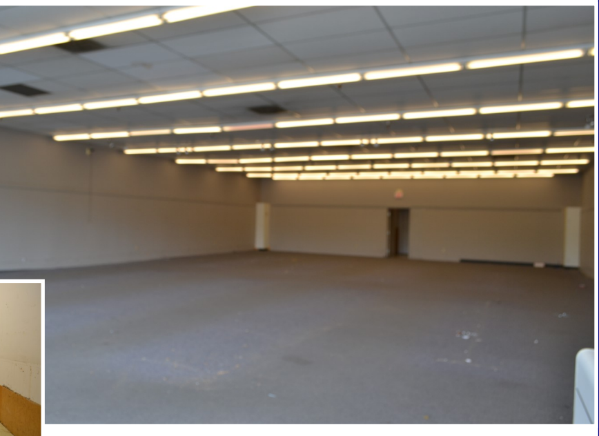
1300 Suite D-1,050 SF