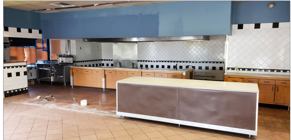
▼ Open kitchen area with drive-thru window.