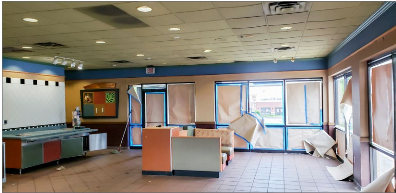
◀ Dining area with ample natural light.