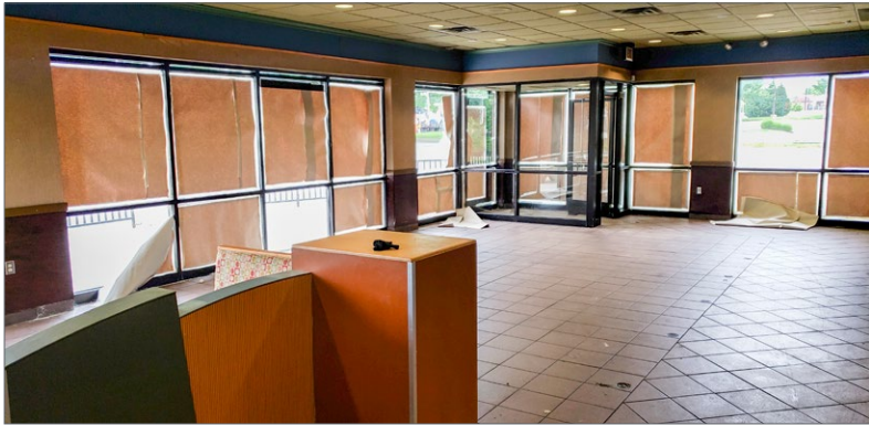
◀ Restaurant lobby and main entrance.

FORMER BOSTON MARKET W/ DRIVE-THRU 12005 Metcalf Ave | Overland Park, Kansas