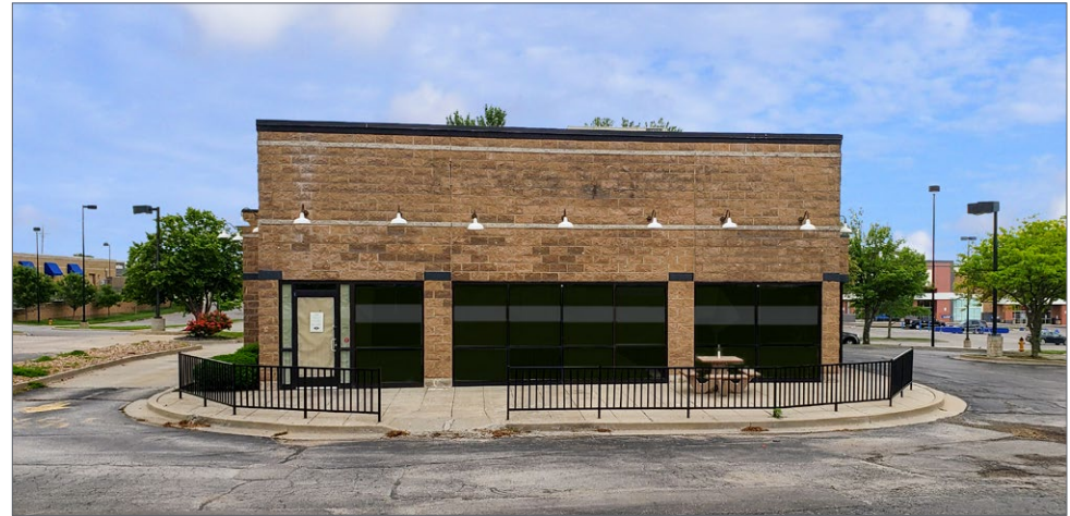
▲ Large patio for outdoor dining and drive-thru with wrap around lane.