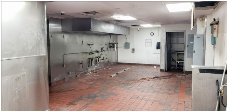
◀ Back-of-house kitchen area.