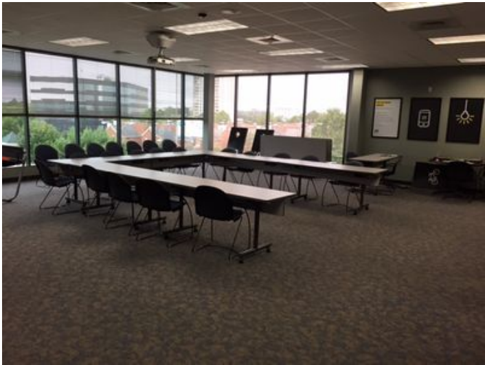
CC-4th floor conf