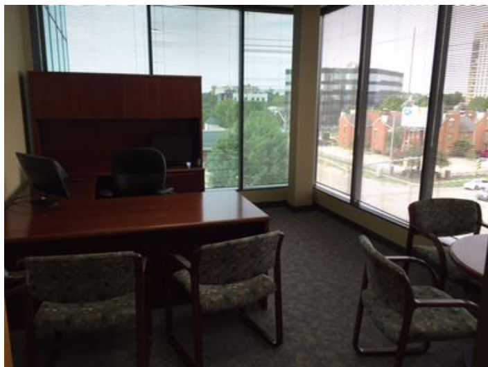
CC-4th floor typical office