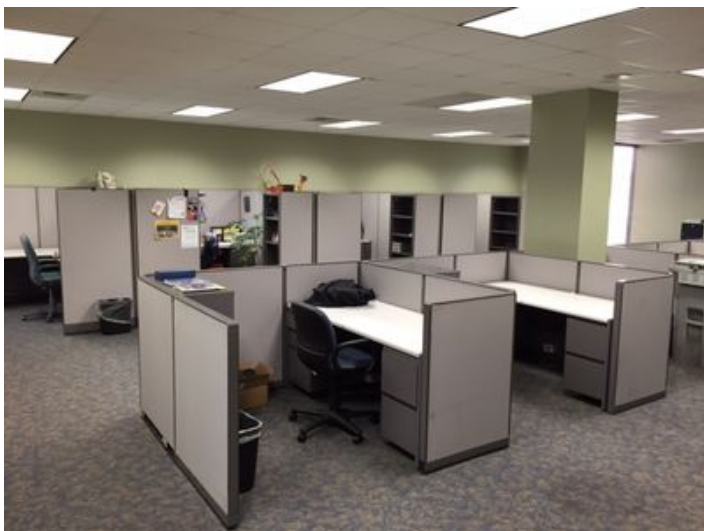
CC-4th floor west open area