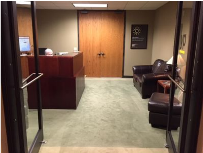
CC-4th floor reception