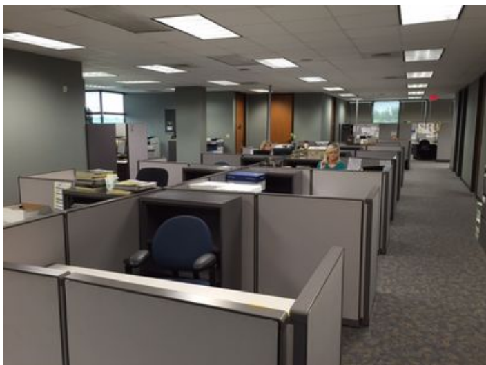
CC-4th floor east open area