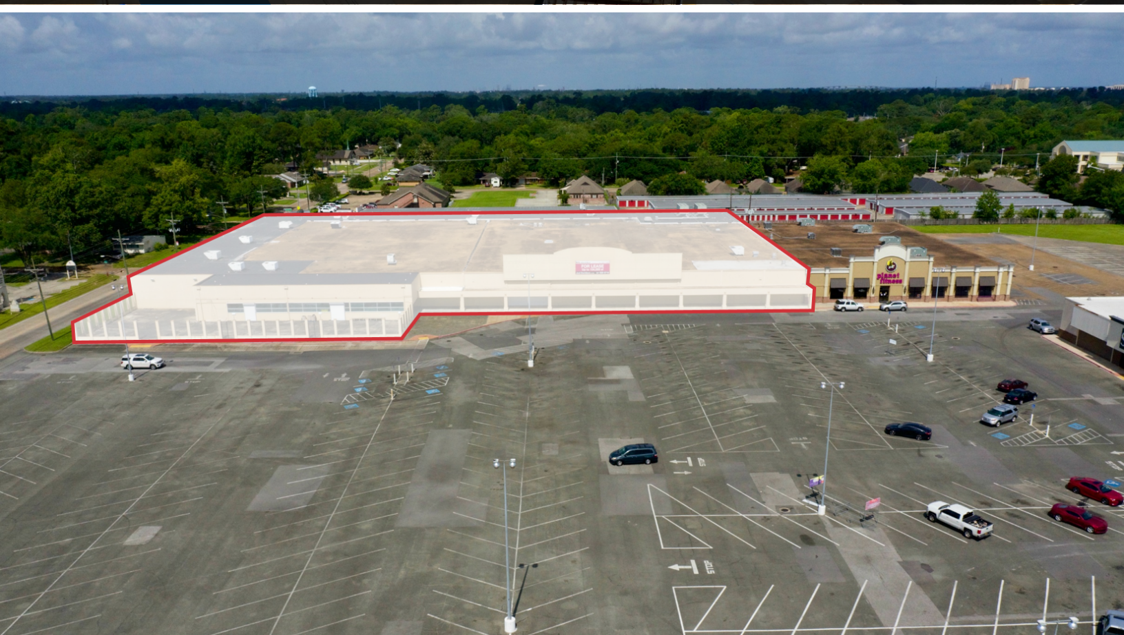
Former K-Mart Space ( \pm 20,000 - \pm 104,333 SF Available)