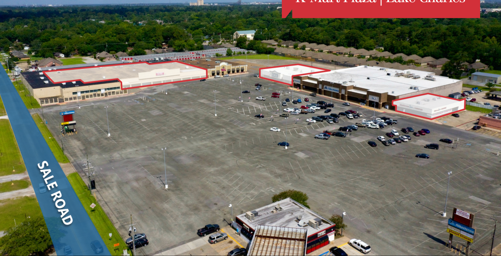
Former K-Mart ( \pm 20,000 - \pm 104,333 SF SF), Former Stage ( \pm 18,000 SF) and Former Mattress Joe ( \pm 9,000 SF)