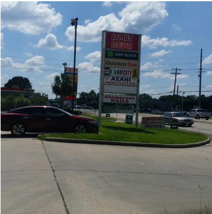
Hwy16 shopping center sign