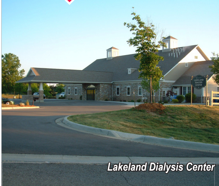
Lakeland Dialysis Center