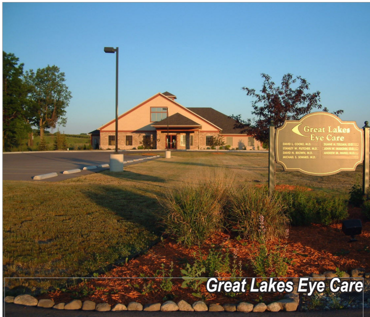
Great Lakes Eye Care