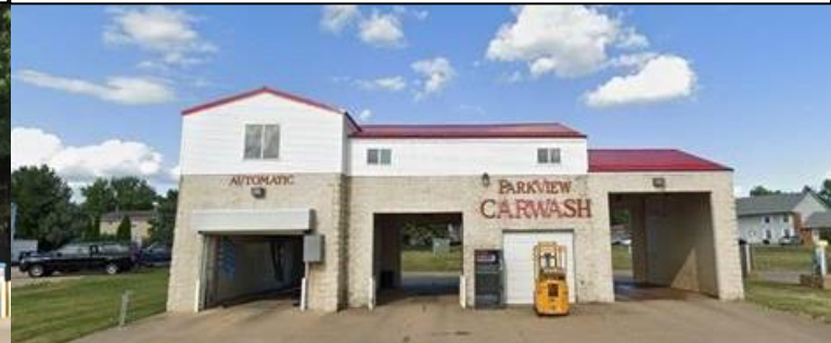
9 Lincoln Avenue Parkview, IA 52748