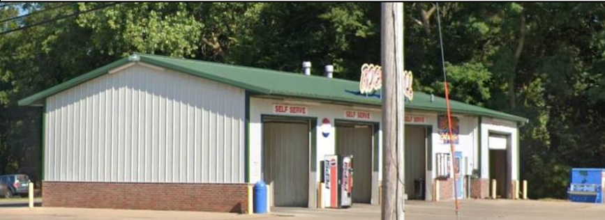
1881 30th Avenue East Moline, IL 61244