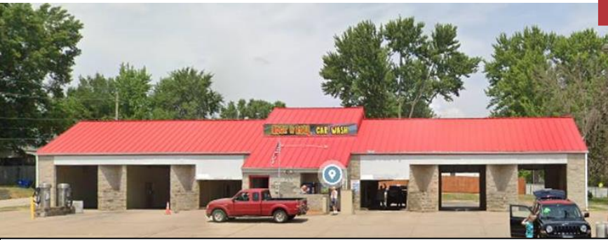
1324 E Locust Street Davenport, IA 52803