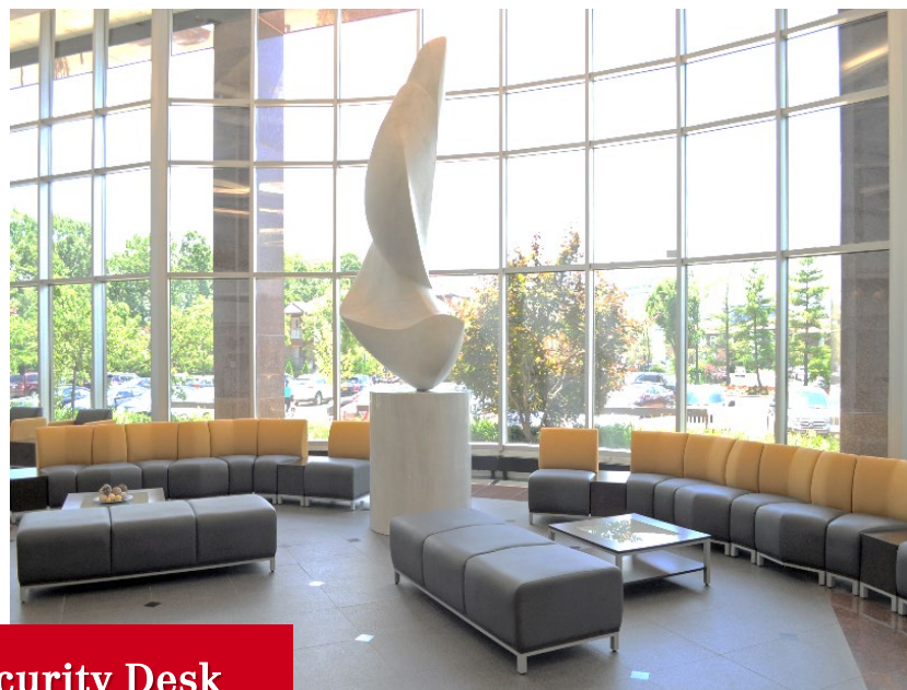
Lobby & Security Desk