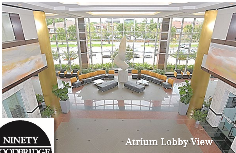
Atrium Lobby View