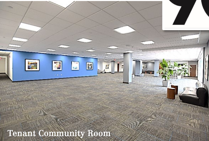
Tenant Community Room