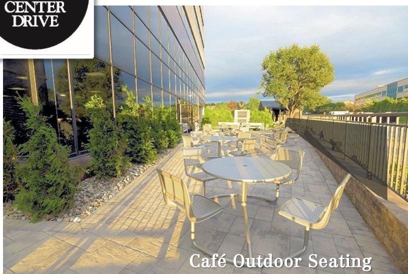
Café Outdoor Seating