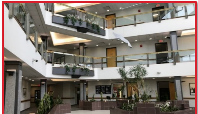
Lobby Featuring Four Story Atrium

**Sublease to 9/29/22 – Longer Direct Term Available