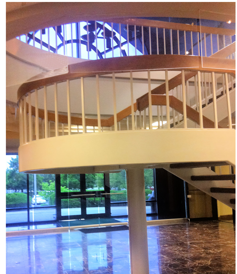
Impressive lobby features include two story entryway, marble flooring, ornamental stairway and custom woodwork.