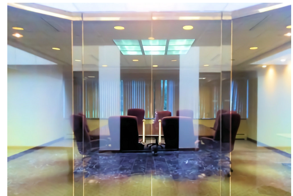
Training/Conference Facility Available