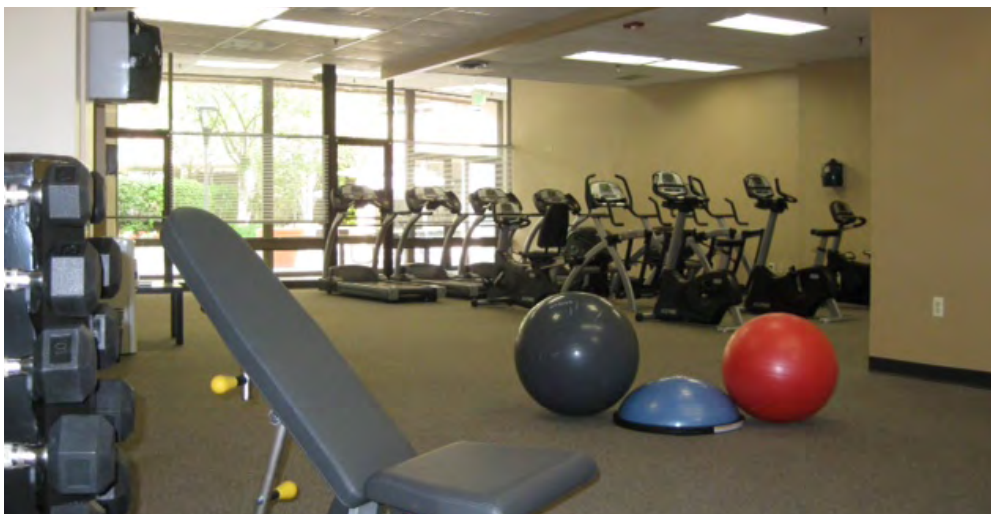
NEW FITNESS CENTER