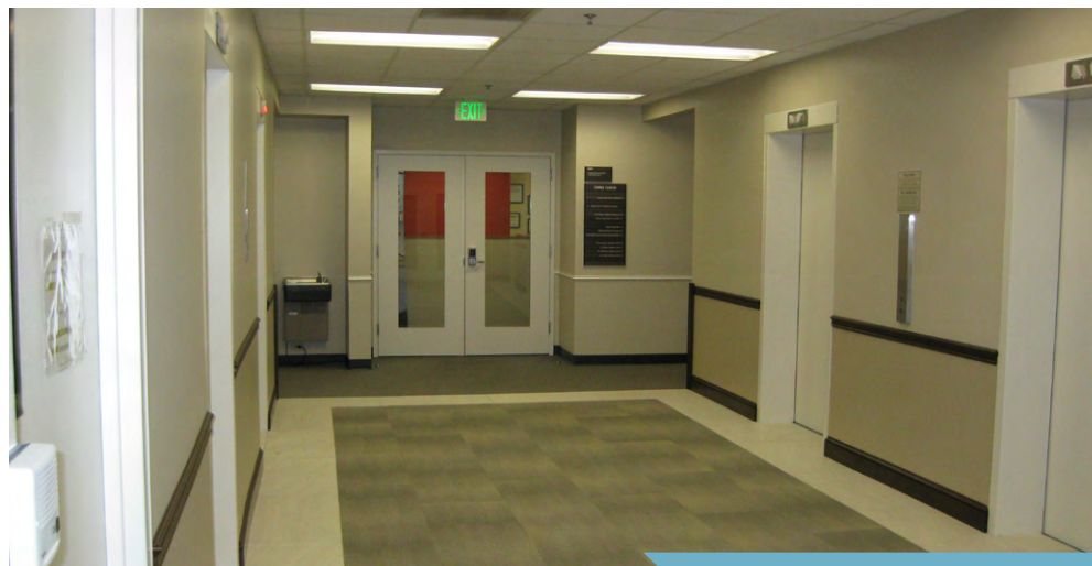
RENOVATED UPPER FLOOR LOBBIES