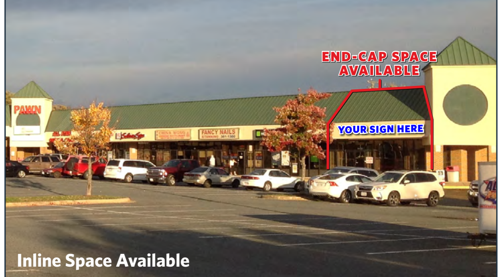
Inline Space Available