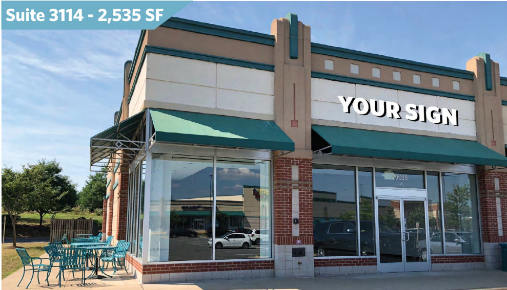
Suite 3114 - 2,535 SF