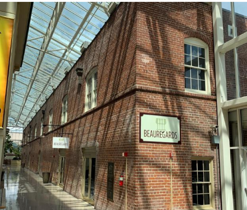
Beauregard Atrium Entry