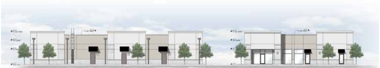
Rear (North) Elevation