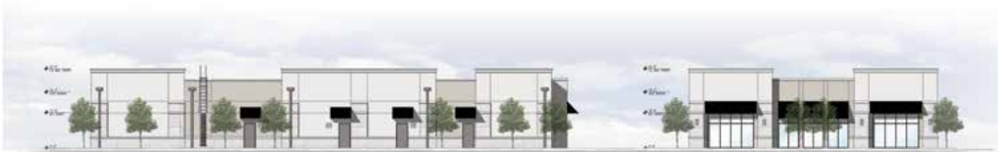
Rear (North) Elevation