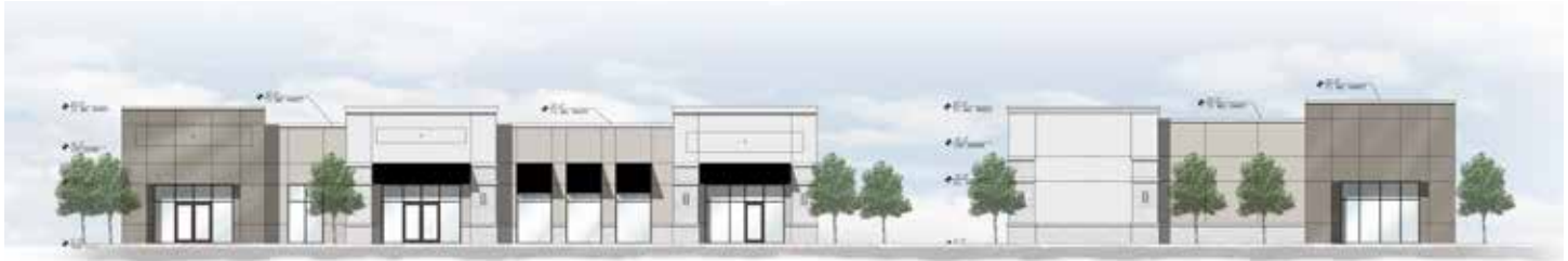
Front (South) Elevation