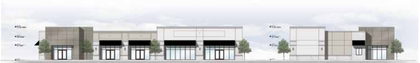
Front (South) Elevation