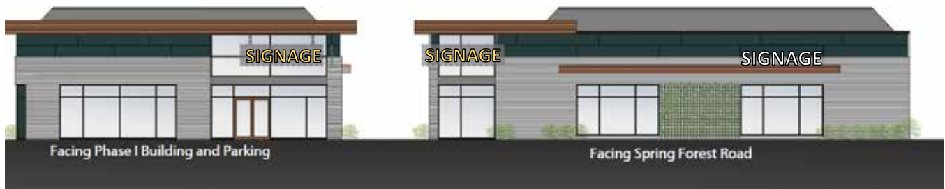
EAST ELEVATION - SKETCH