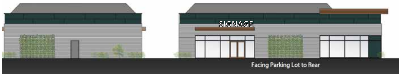
NORTH ELEVATION - SKETCH