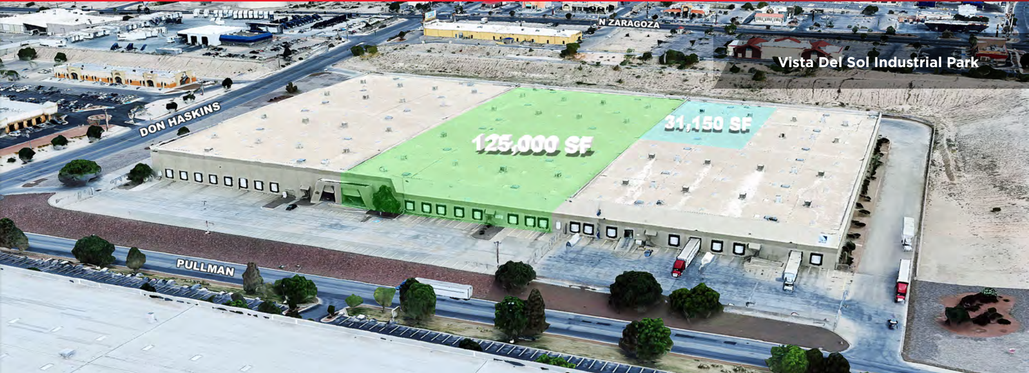
Vista Del Sol Industrial Park