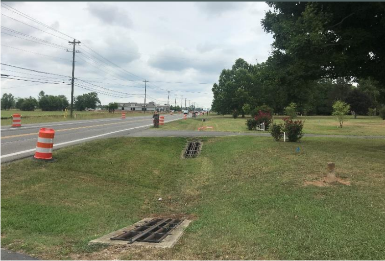
New 5-Lane Highway Under Construction