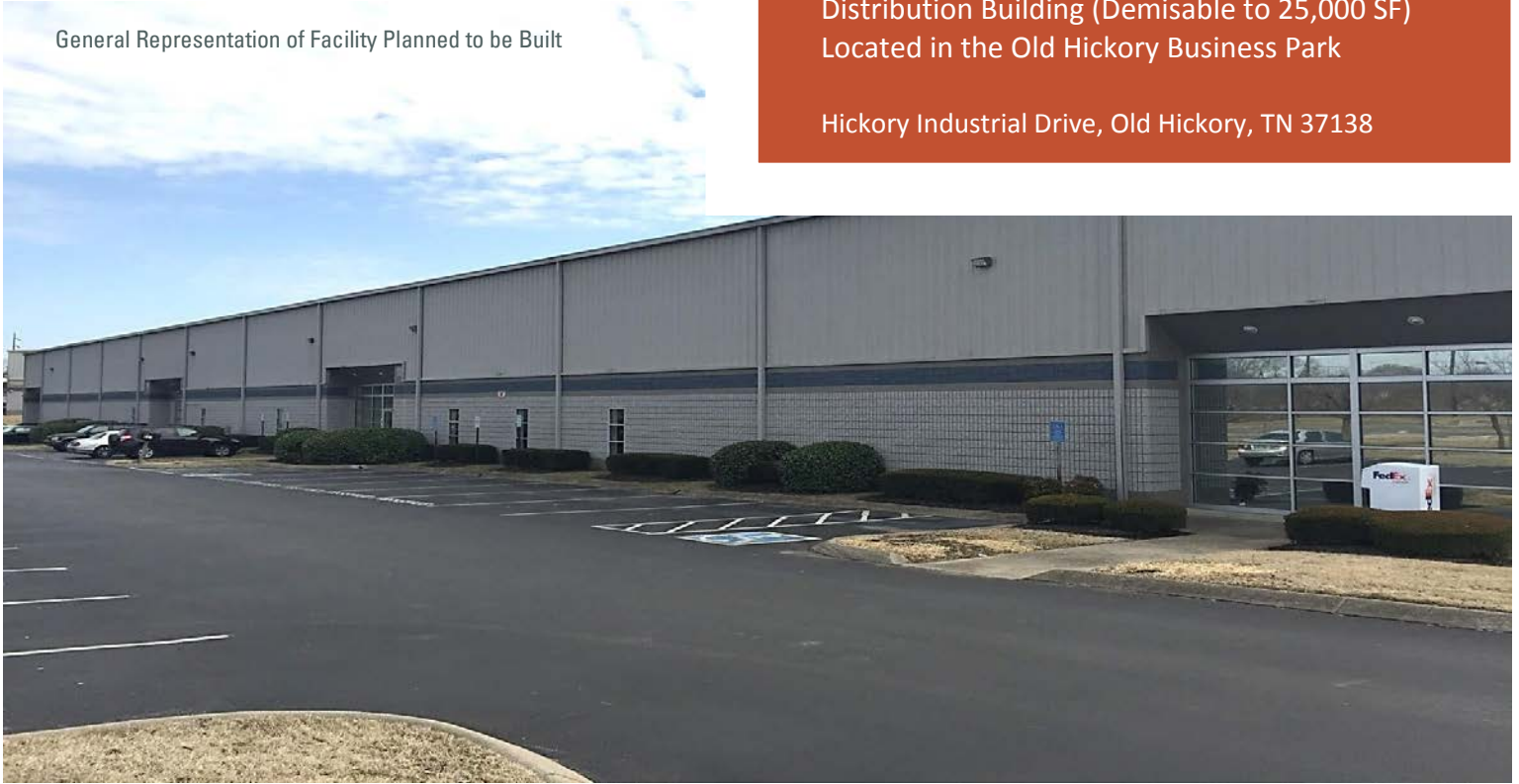
General Representation of Facility Planned to be Built

Hickory Industrial Drive, Old Hickory, TN 37138