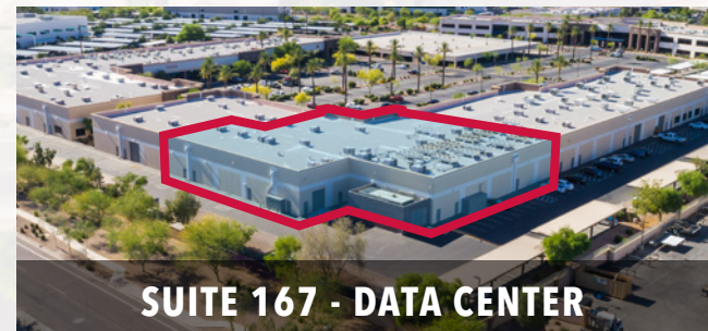
SUITE 167 - DATA CENTER