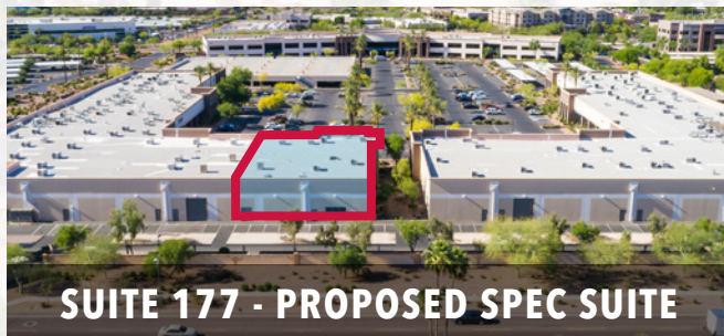
SUITE 177 - PROPOSED SPEC SUITE