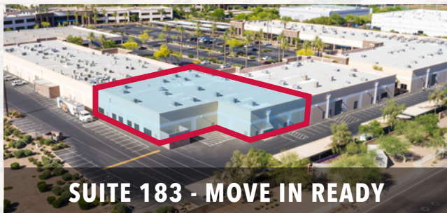
SUITE 183 - MOVE IN READY