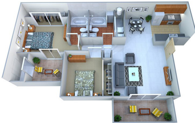
2 BD/2 BA (885 SF)