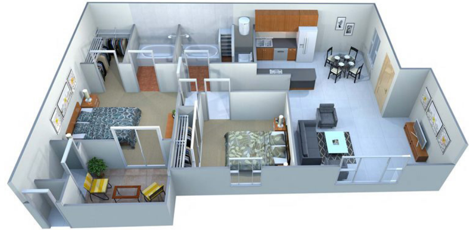
2 BD/2 BA (878 SF)