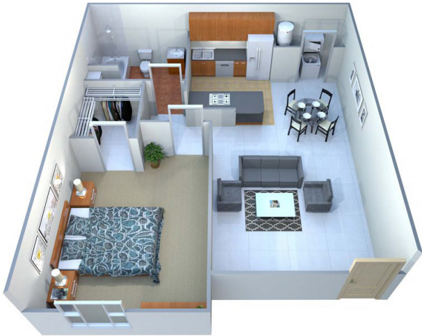
1 BD/1 BA (632 SF)