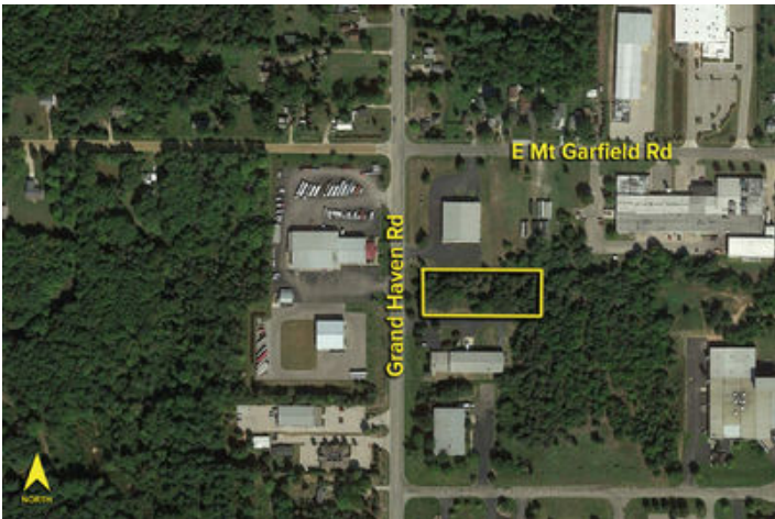
Muskegon_5862 Grand Haven