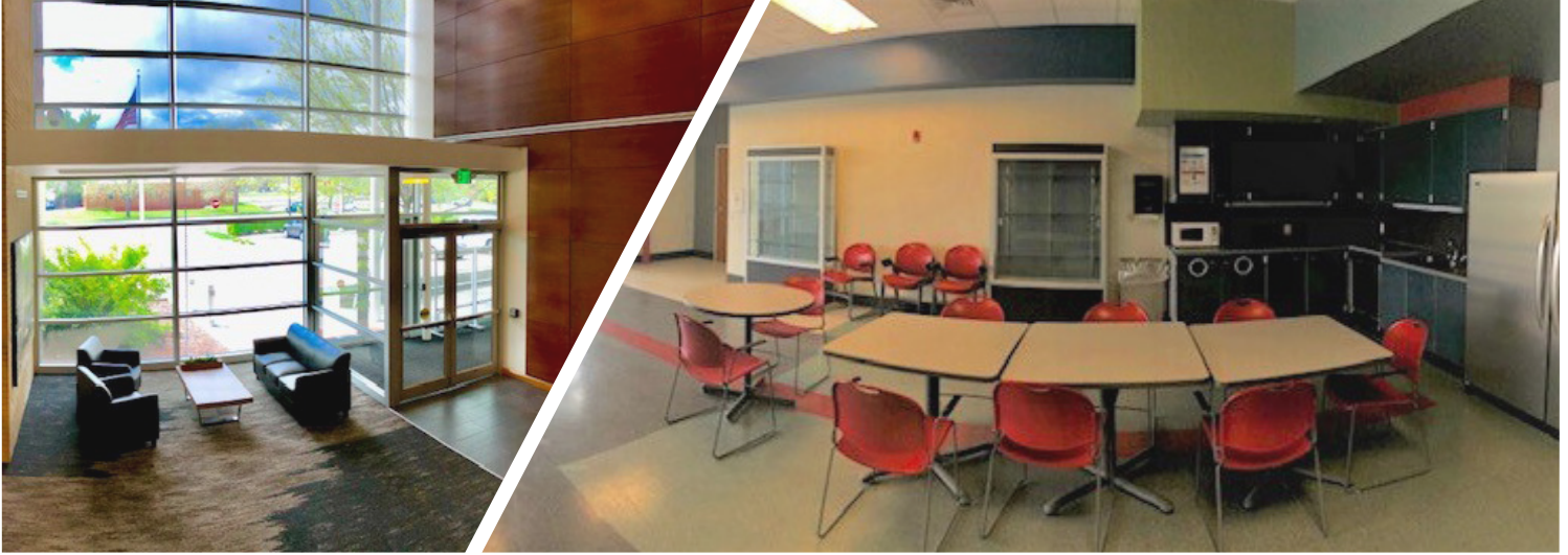
First Floor: Fully Leased