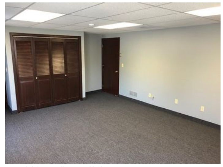
personal sink & room for personal fridge