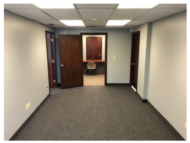
Could be used as another office