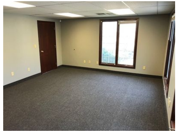
33 College Main Office