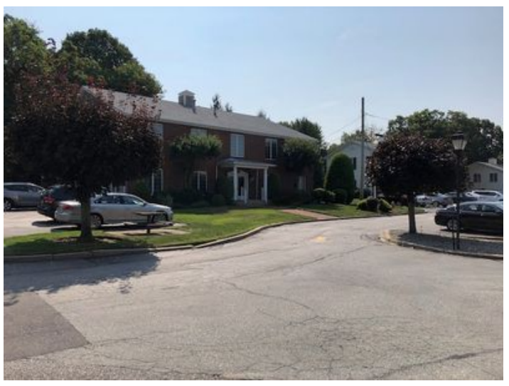
Tons of parking