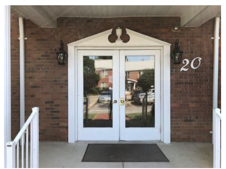
Building 20G Front Door