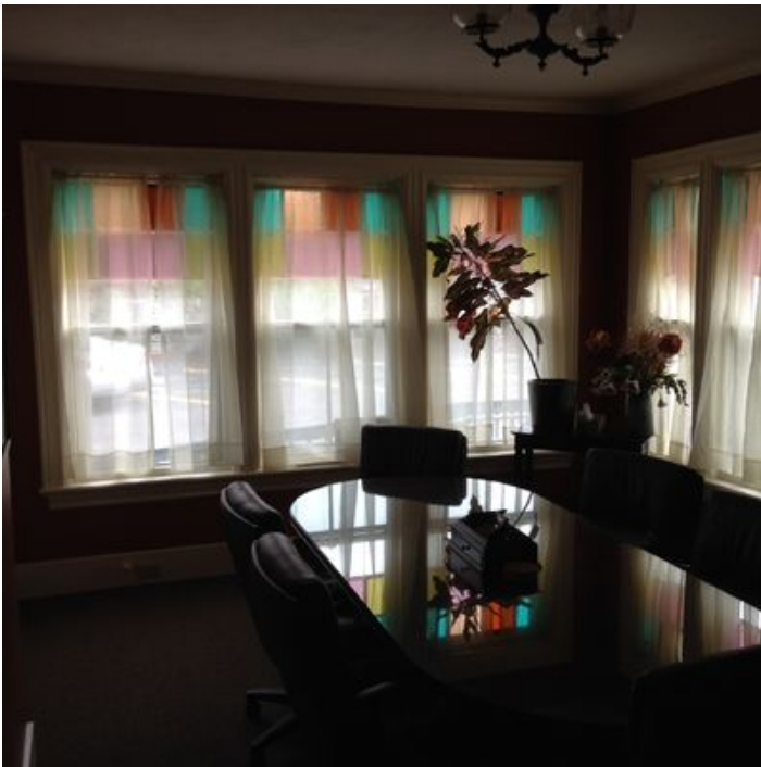
Stained glass - Copy