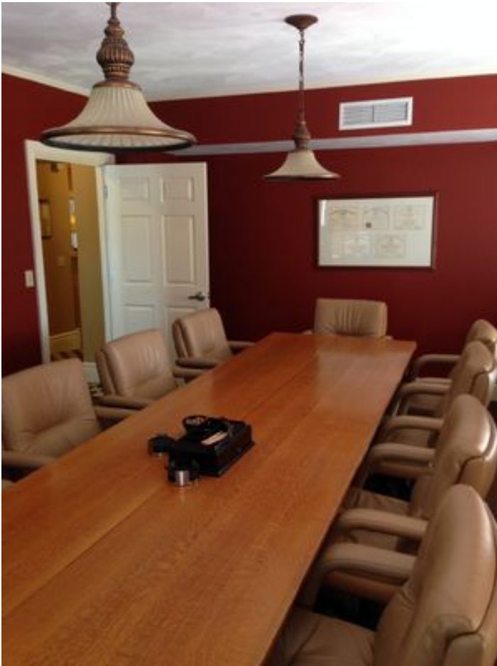
conf room 1