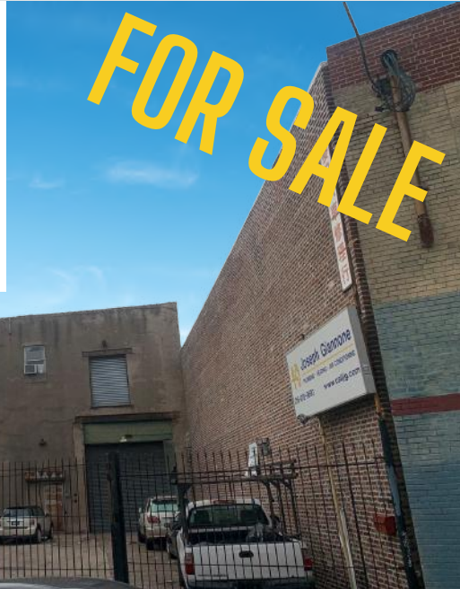
Frontage along E. Passyunk Ave. and S. Darlen St.