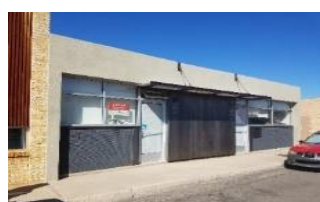
Some of Consuelo's Recent Transactions