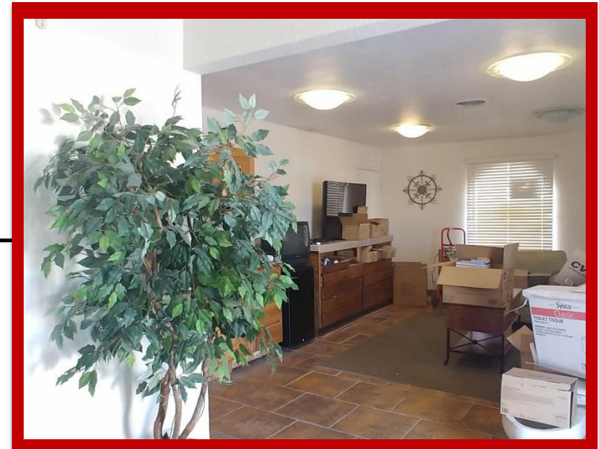
Comfortable Motel Lobby