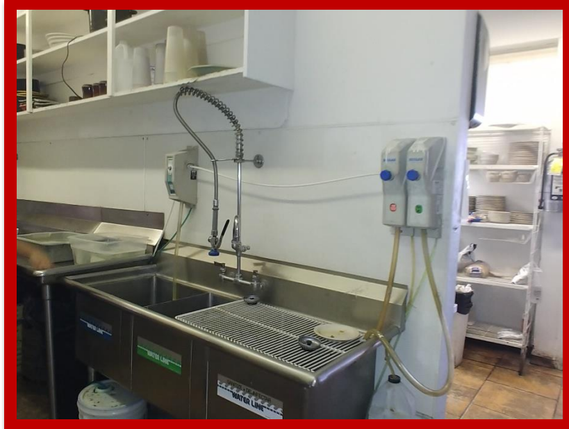
Newly Updated Kitchen