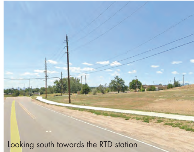
Looking south towards the RTD station