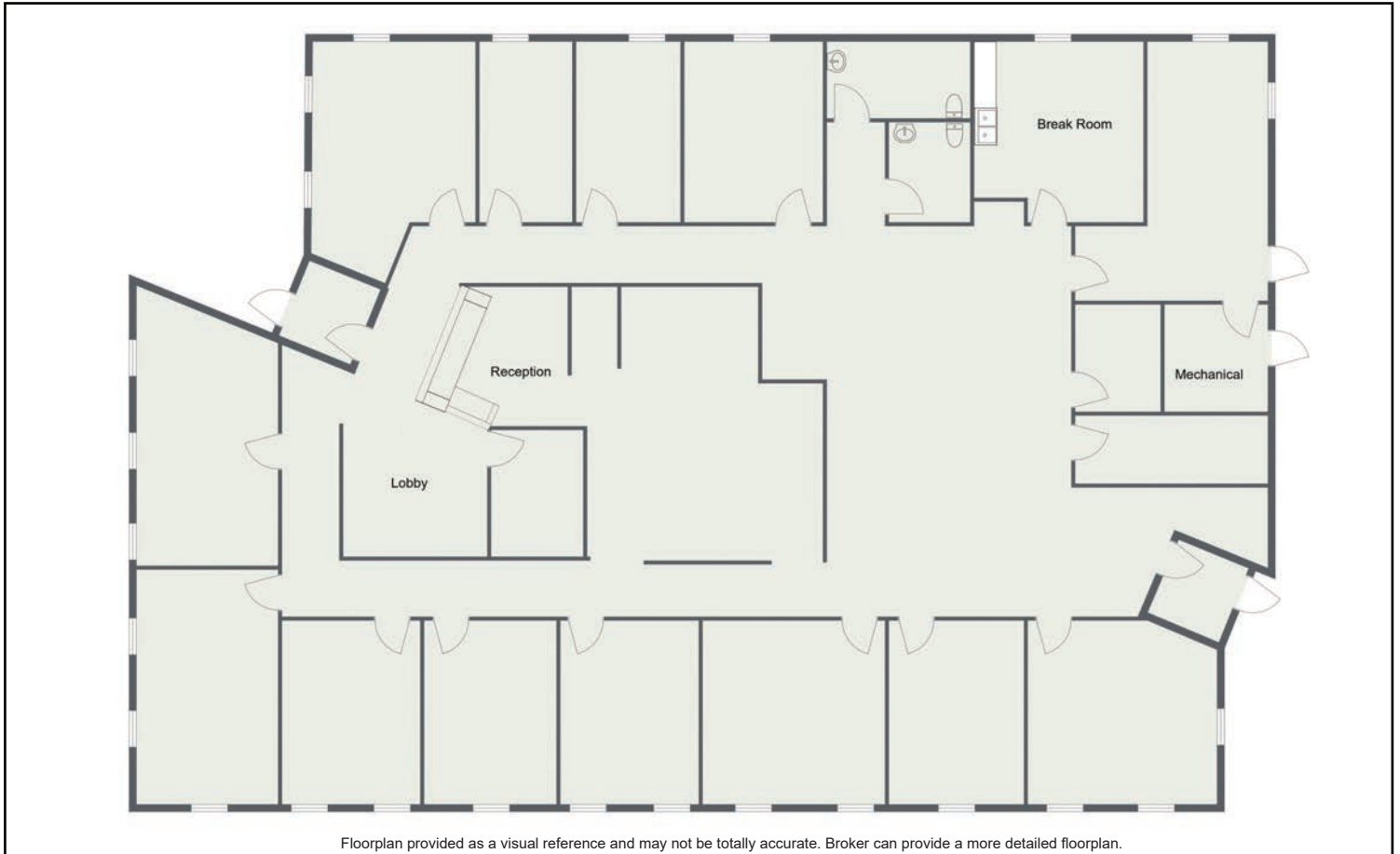
Floorplan provided as a visual reference and may not be totally accurate. Broker can provide a more detailed floorplan.