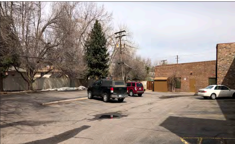
Parking Behind the Building