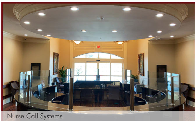
Nurse Call Systems

104 MBL BANK DRIVE MINDEN, LOUISIANA 71055