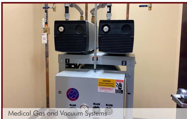
Medical Gas and Vacuum Systems