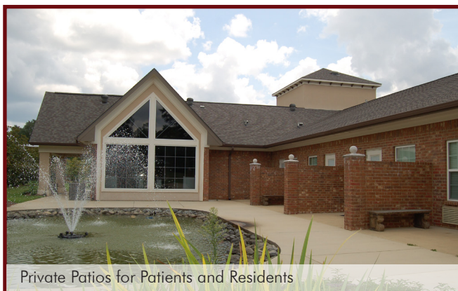
Private Patios for Patients and Residents