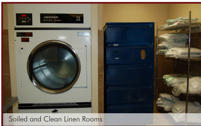
Soiled and Clean Linen Rooms