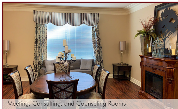
Meeting, Consulting, and Counseling Rooms