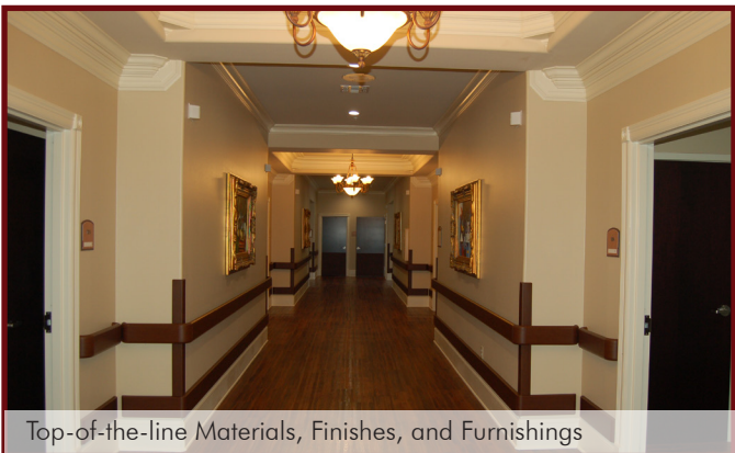
Top-of-the-line Materials, Finishes, and Furnishings