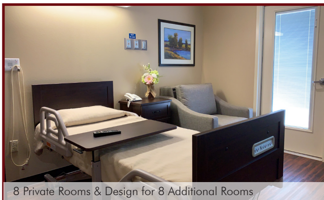
8 Private Rooms & Design for 8 Additional Rooms