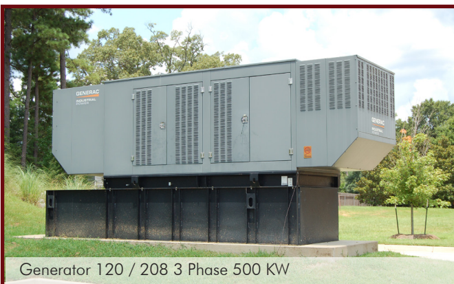
Generator 120 / 208 3 Phase 500 KW