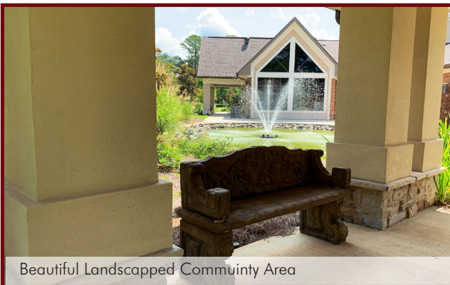
Beautiful Landscaped Community Area